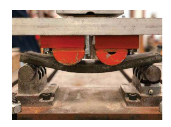
High deflection capacity of Engineered Cementitious Composites (ECC) material developed at LSU

A new concrete U.S. patent has been secured for a group of Louisiana researchers. Using sugarcane bagasse ash (SCBA) as a main ingredient, the team created a specially engineered cementitious composite or "bendable concrete."