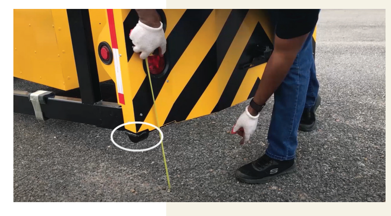
To view this published training video, please go to https://www.youtube.com/watch?v=y4r-mhmy4rMk.

demonstrates how to properly connect and inspect the SMT to ensure it is prepared for use. To accompany the visual display of guidance for proper setup of the SMT in work zones, DOTD has updated the following training manuals: Traffic Control Through Maintenance Work Areas Handbook and District Specified Traffic Control PLAN (TCP). These materials provide DOTD employees with access to safety requirements, rules for placement and movement, and spacing guidance for SMTs during operations.